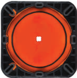
Bottom of Cone