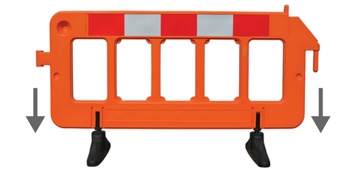
Step 4. Connect multiple Barriers with the linking brackets to achieve the desired configuration.