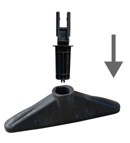
Step 2. Using a sturdy block as a lever, turn the Connectors counterclockwise until the pronged ends are in line with the rubber feet, as shown.

Step 1. Insert the solid end of the Connector into the hole of the Rubber Foot. Repeat for the other foot.